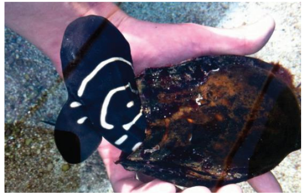
Leopard shark pup hatching from egg case.